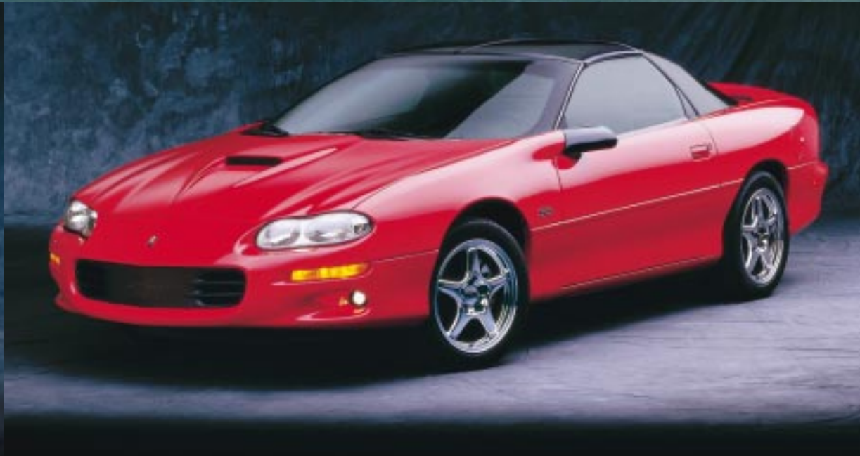
Camaro SS shown with SLP's optional chrome wheels and Performance Exhaust with dual-dual outlets.